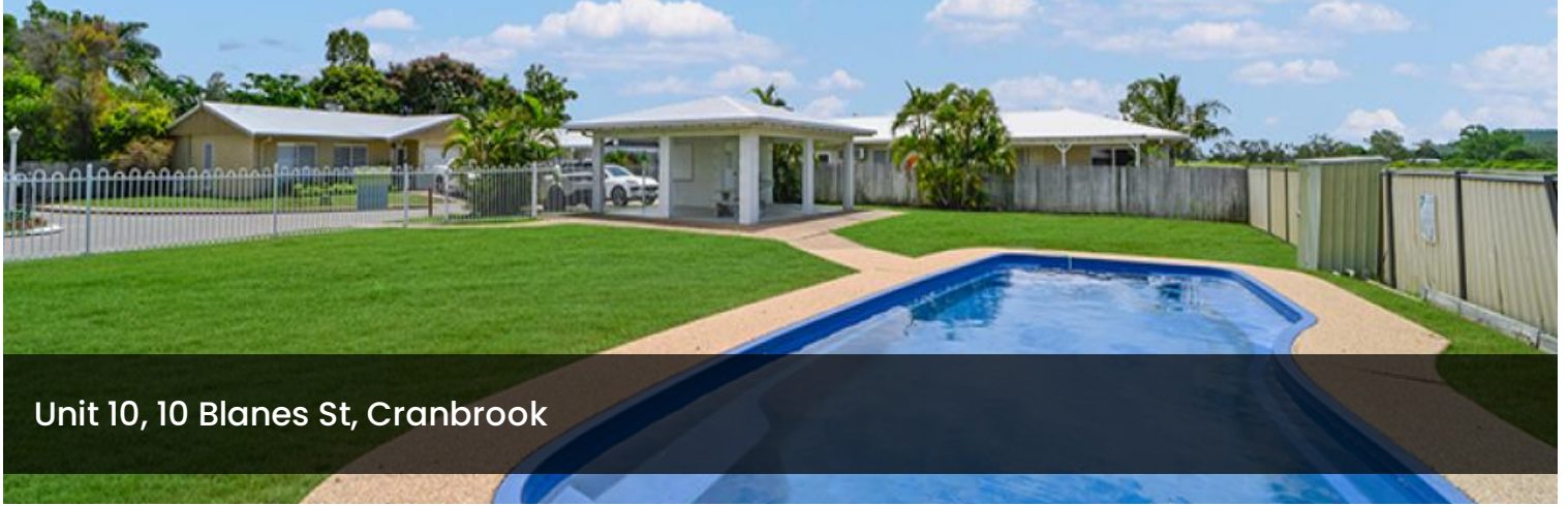
Unit 10, 10 Blanes St, Cranbrook